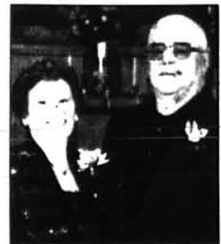
tude and love for being their parents. Your family wishes you the best now and always.

The children would like to congratulate them on their many years of marriage and for reaching this momentous milestone. They also wish to express sincere grati-