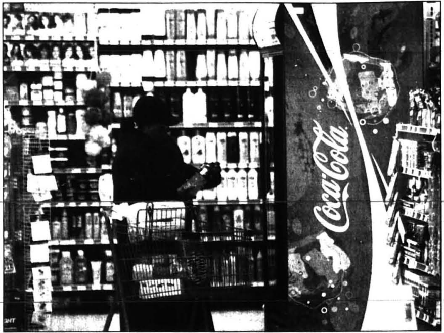
A customer shops the grocery section at the Family Dollar discount store in Brooklyn, New York.