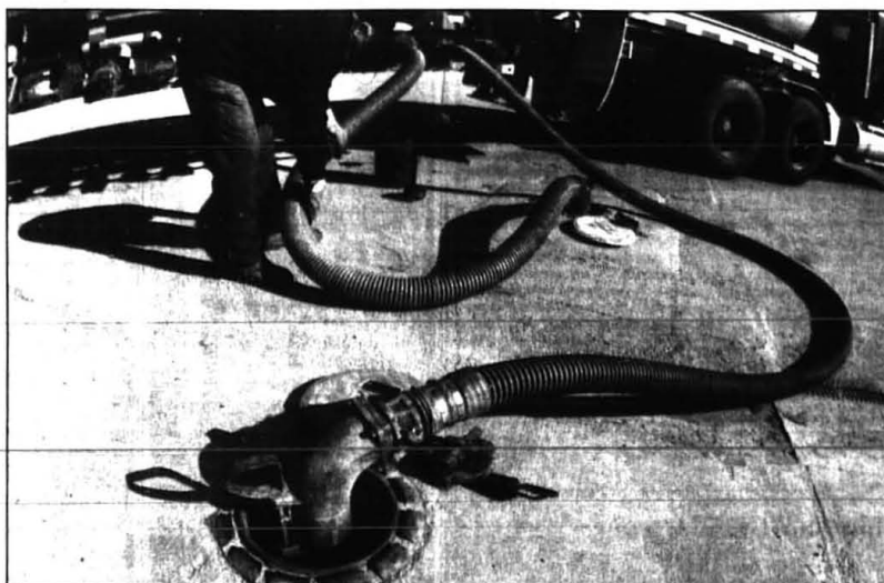
A worker completes a fuel delivery at gas pumps in Lynnfield, Mass. Wholesale prices shot up at double the expected pace in January, propelled higher by big increases in energy costs.