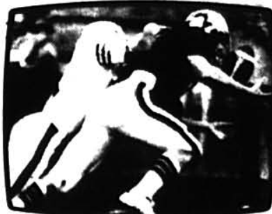
When you have Cablevision you know that you're seeing your favorite sports...

"When I'm lookin' for action, I turn on ESPN."