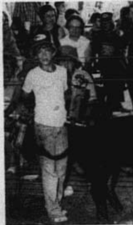
GRAND CHAMPION — [The] boar was named grand champion during the 1980 Logan County Fair.

Memorials may be made to the church or to Mount Hope Township Library.