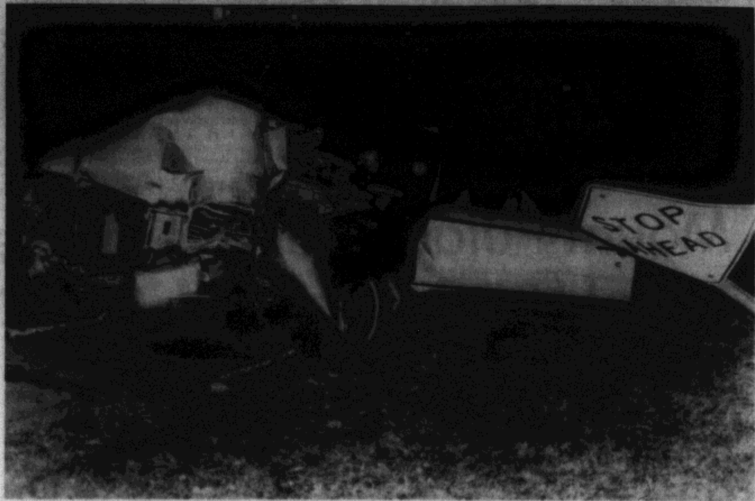
FATALITY — A one car accident in the 1800 block of Broadway Street killed a Lincoln woman Friday evening. Lincoln police are still investigating the accident and a scuffle with police which occurred with bystanders at the scene of