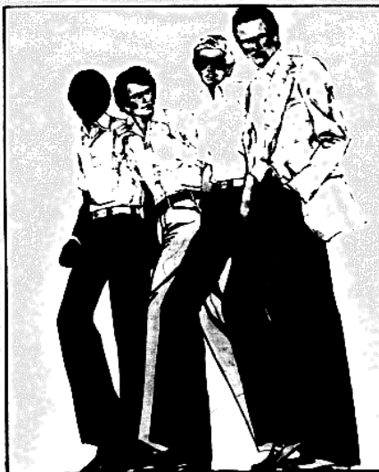
Enclave's polyester is a big signal. These Haggag double-knit slacks are the best in synthetic investment you can make. As double-knit, you get Haggag's quality tailoring, Handmade styling. And the Comfort Plus™ fit Haggag is famous for. 100% wair exact tone from a variety of rich solid colors. All completely machine washable. 100% non-glitter Enclave polyester double-knit. The best value on the market at just $25.

CELEBRATE HAGGAR WEEK COME IN AND REGISTER FOR LAS VEGAS WEEKEND FOR TWO